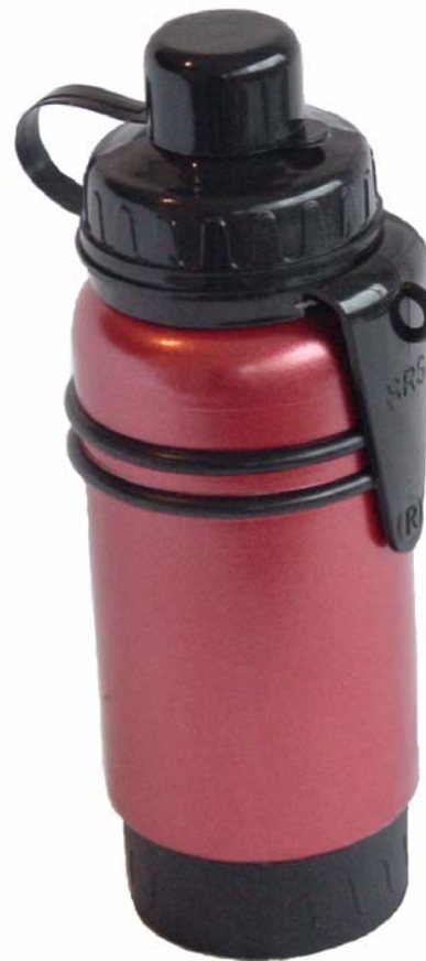
Sport bottle (Bidon) with SRS