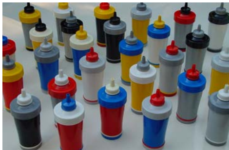
The SRS used for non-spilling cups

Tel.: +31-(0)180-390138 Fax.: +31-(0)180-390139 Email: info@enpros.nl